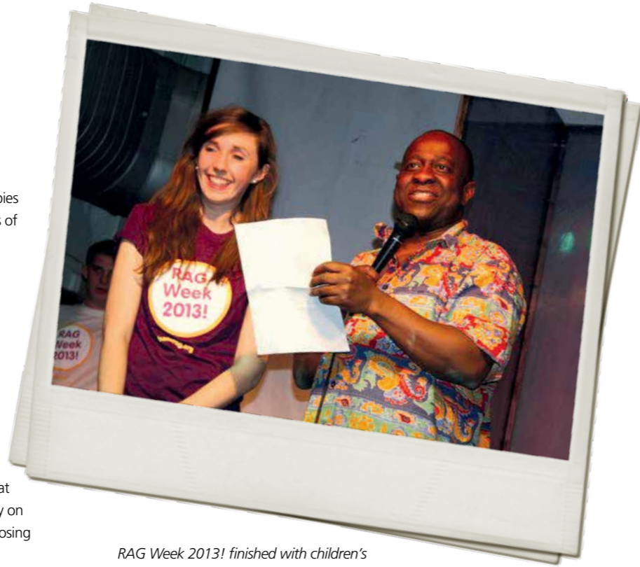
RAG Week 2013! finished with children's TV star Dave Benson-Phillips gunging famous SU names.

Our partnership with LSE SU RAG is our first with a student RAG and it has been fantastic in both spreading awareness and helping us raise funds to keep our centre going."