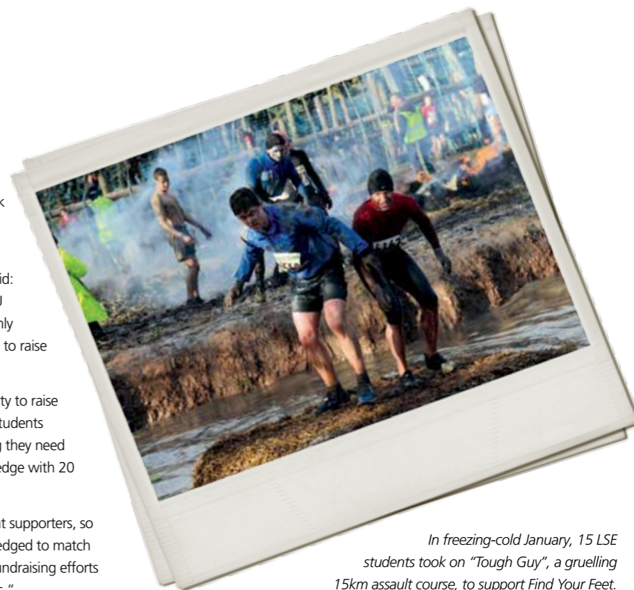
In freezing-cold January, 15 LSE students took on "Tough Guy", a gruelling 15km assault course, to support Find Your Feet.