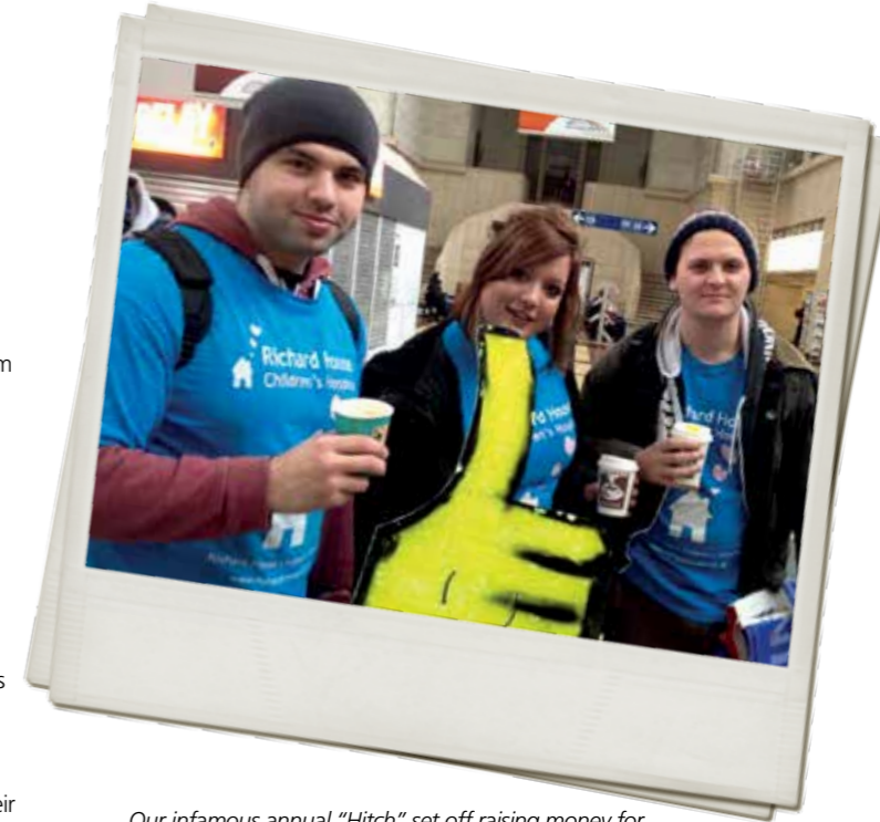
Our infamous annual "Hitch" set off raising money for Richard House. Participants raced from London to Prague spending nothing along the way!