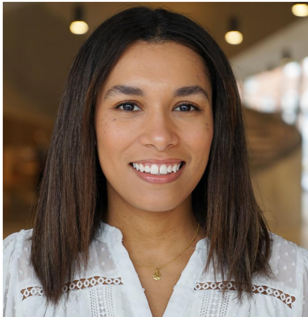
Super Serena and Leader