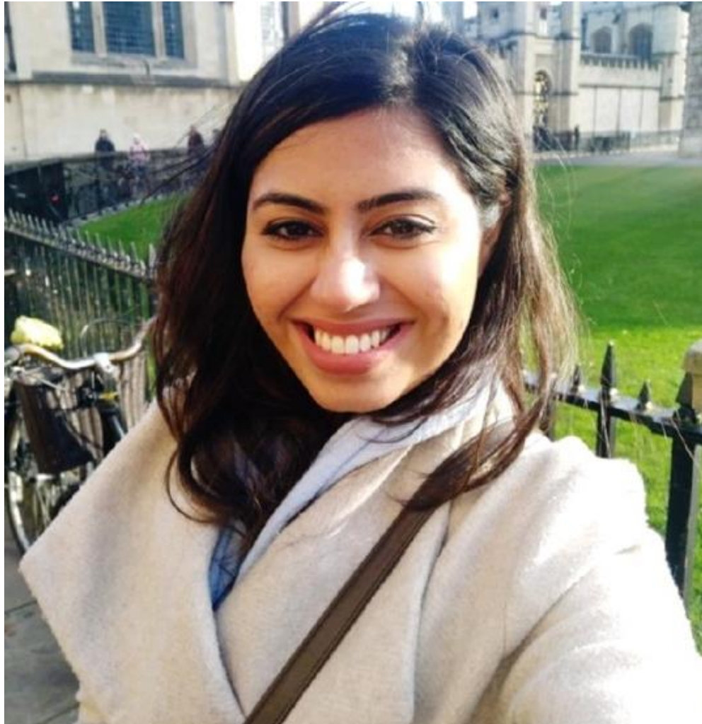
Leader and Phenomenal