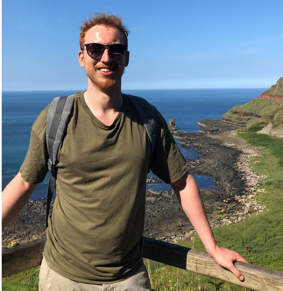
Calm and collected