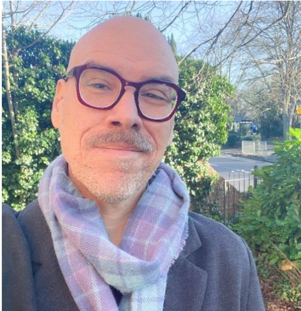
Pillar of Strength