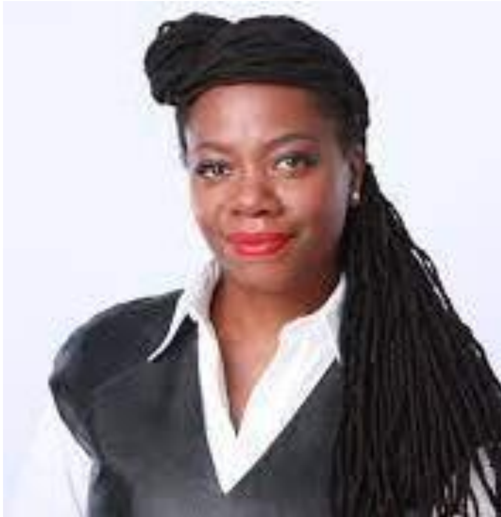
Full of light