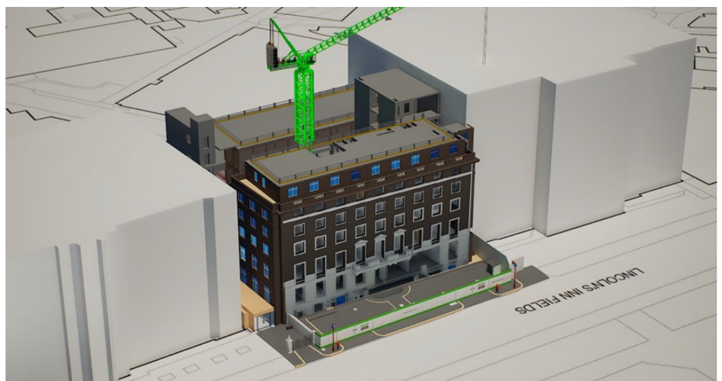
Diagram showing position of tower crane to be installed—see page 3