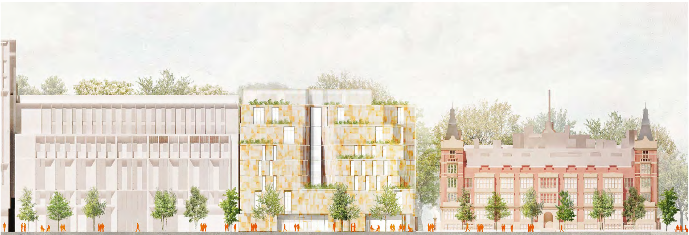
Portugal Street Elevation - 1:500