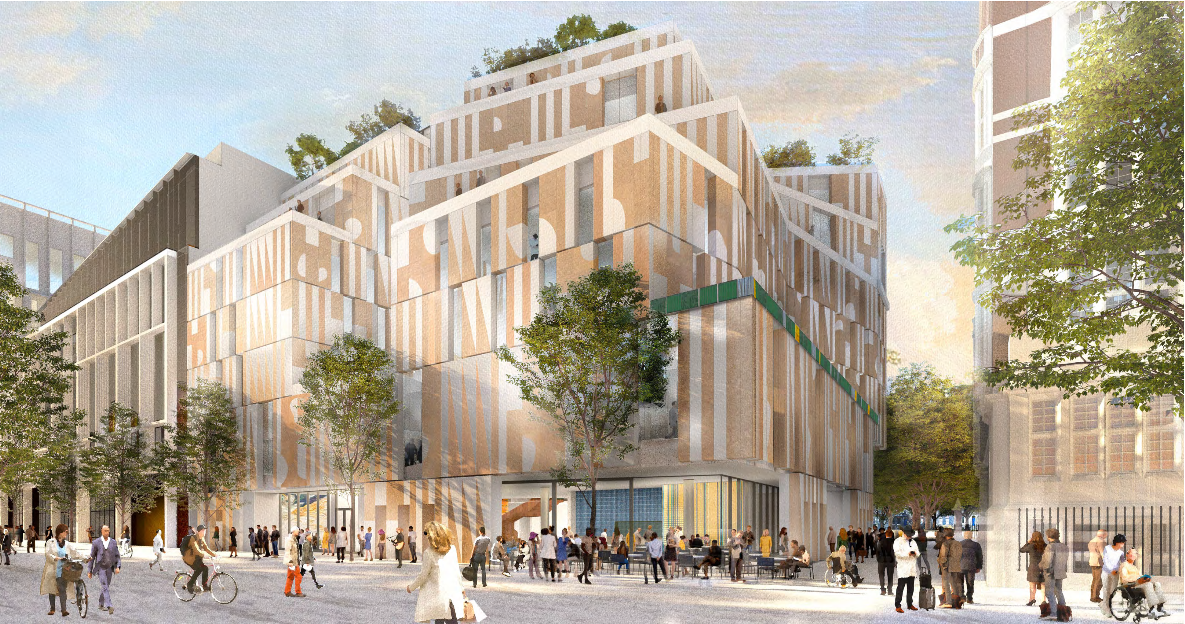
Portugal Street perspective looking north-west through the alley towards Lincoln's Inn Fields