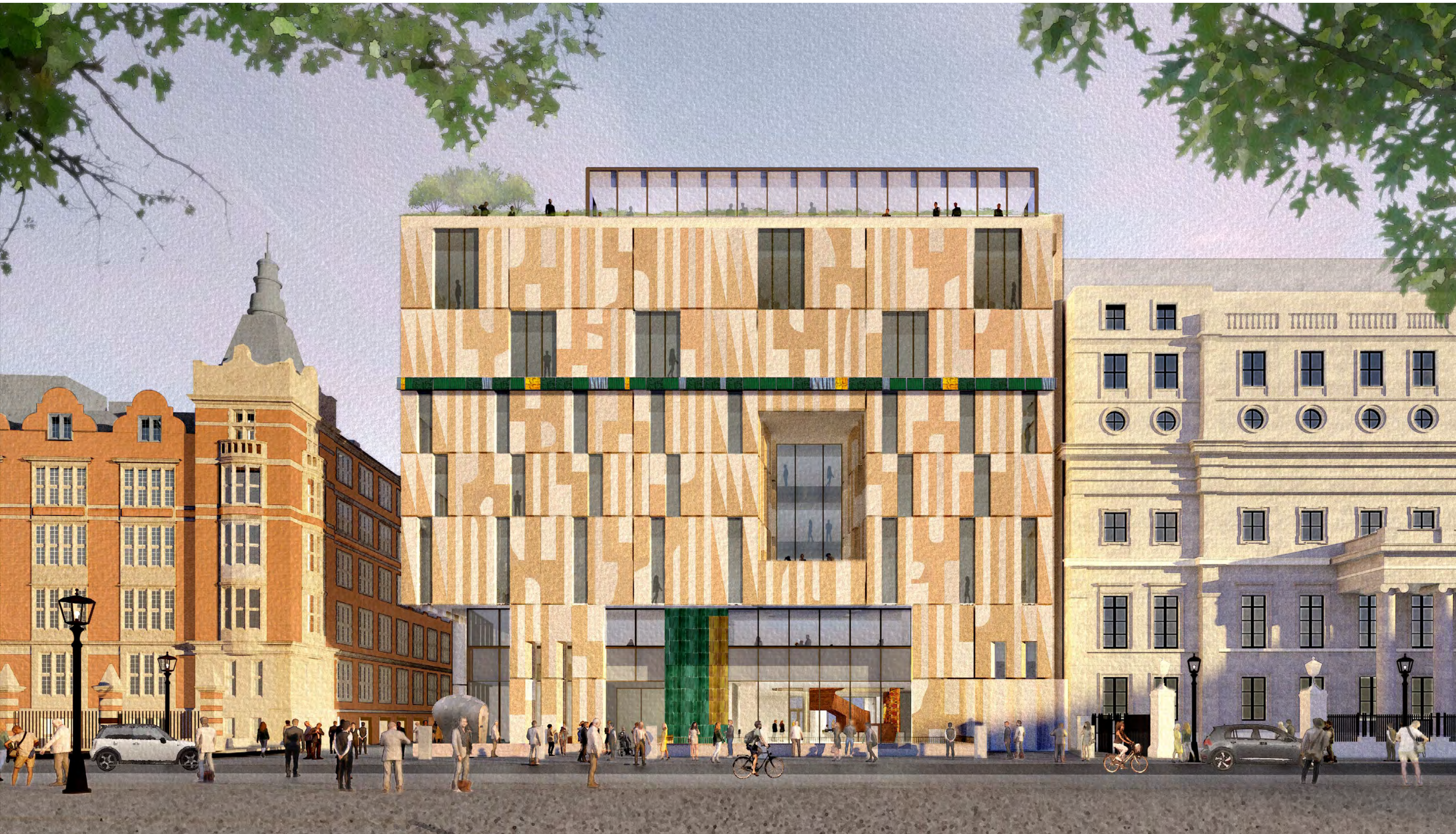
Ground level perspective of the Lincoln's Inn Fields Elevation