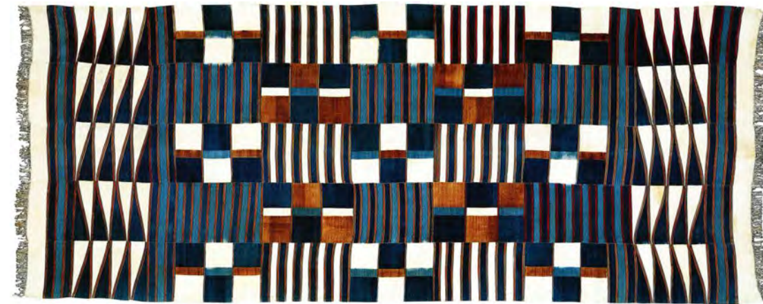
Facade Reference, Carpet, Kpokpo, Vai or Mende people, Sierra Leone

In our design, warmth and texture are composed of sandstone, coloured concrete and faience. Founded in London's past and present, The Firoz Lalji Global Hub alludes to the richness and diversity of African and global cultures.