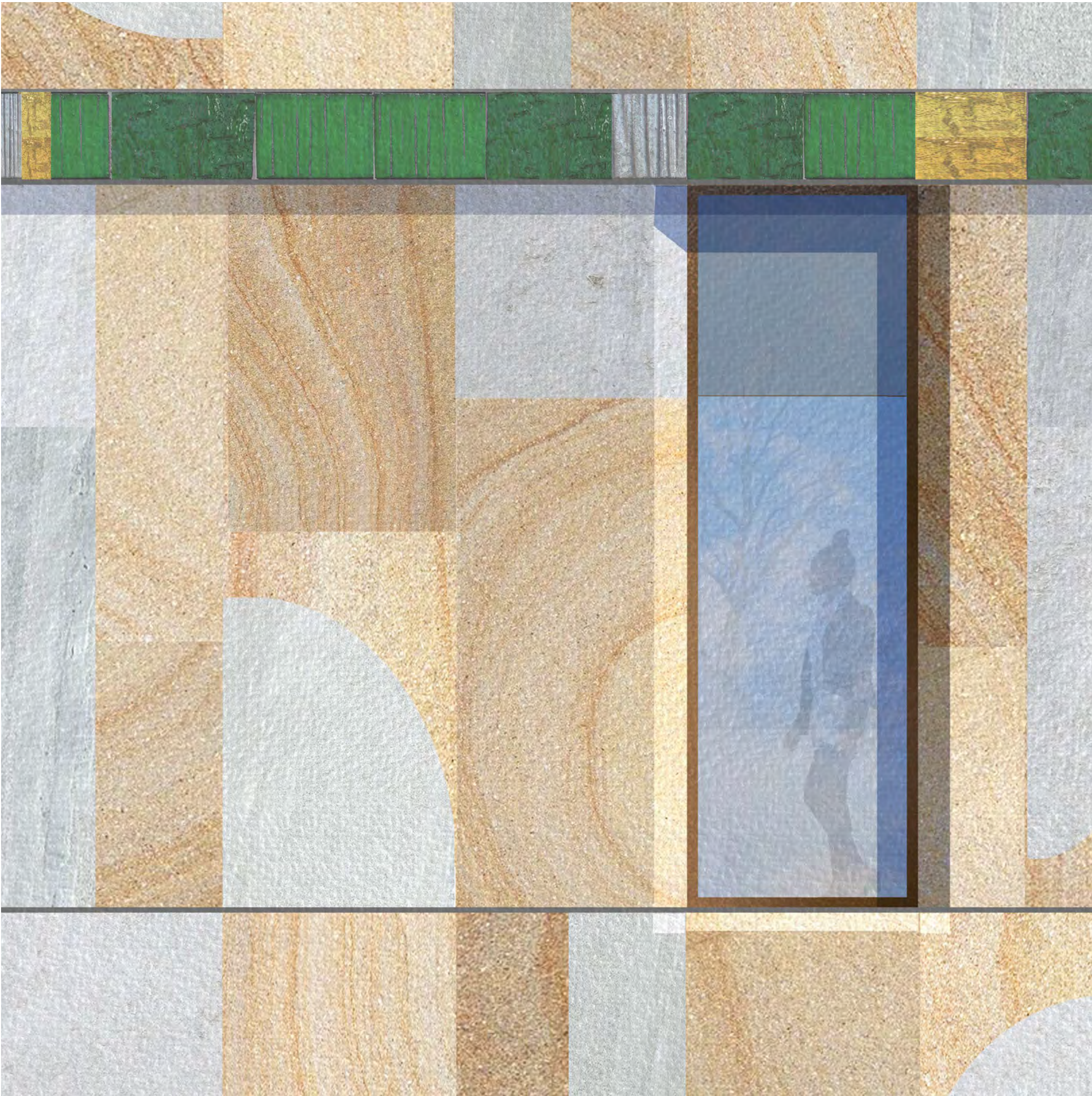
Detail elevation collage, 1:20