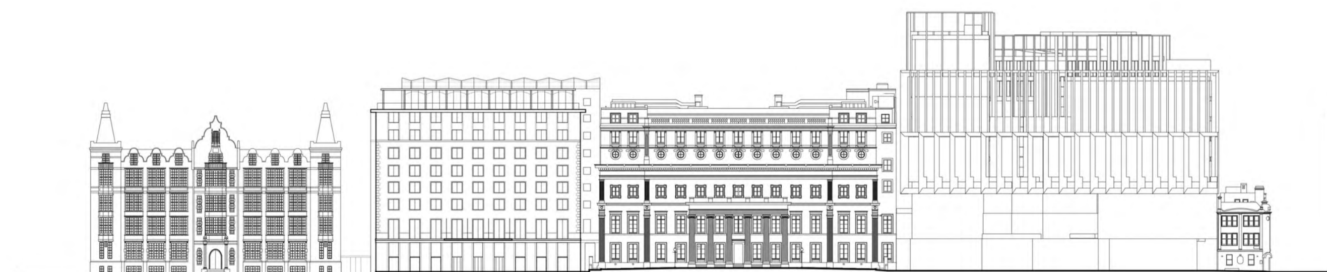
Lincoln's Inn Fields elevation showing framing of Royal College of Surgeons