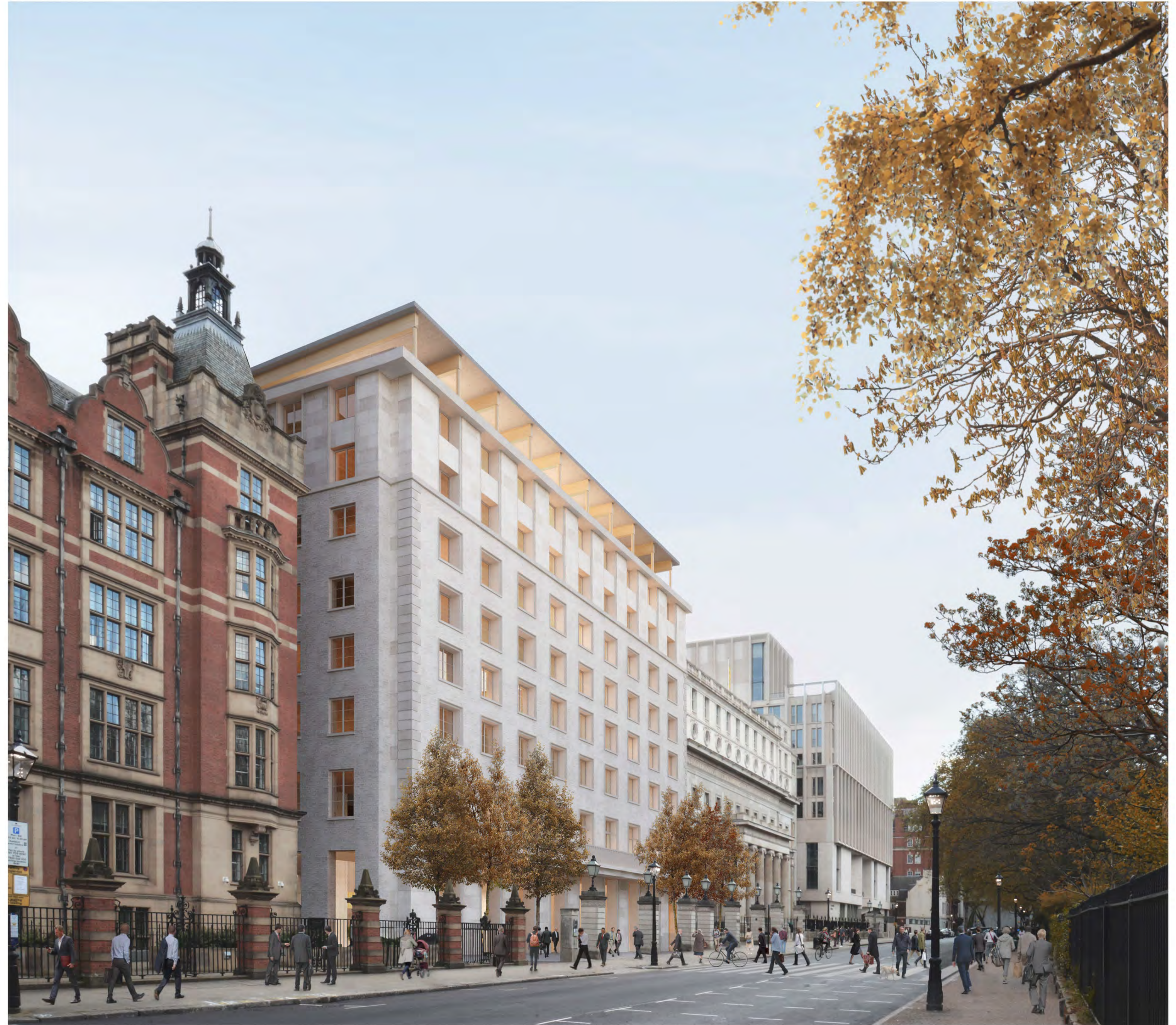
View looking west showing entrance forecourt, extended facade and new rooftop pavilion. Appearing a civic palazzo, the building opens out to LIF and strengthens the presence of LSE in the city.