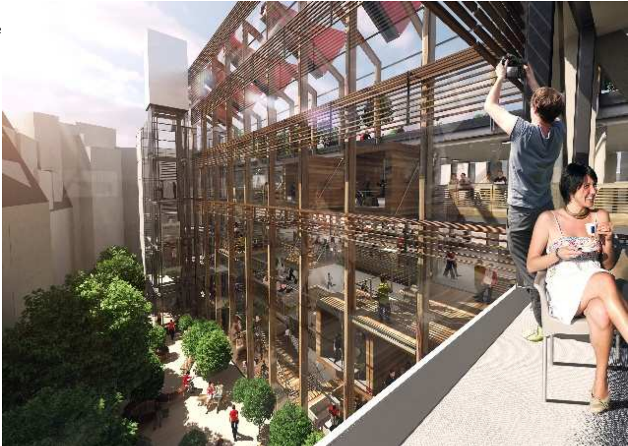
Global Centre for Social Sciences proposal – Team E