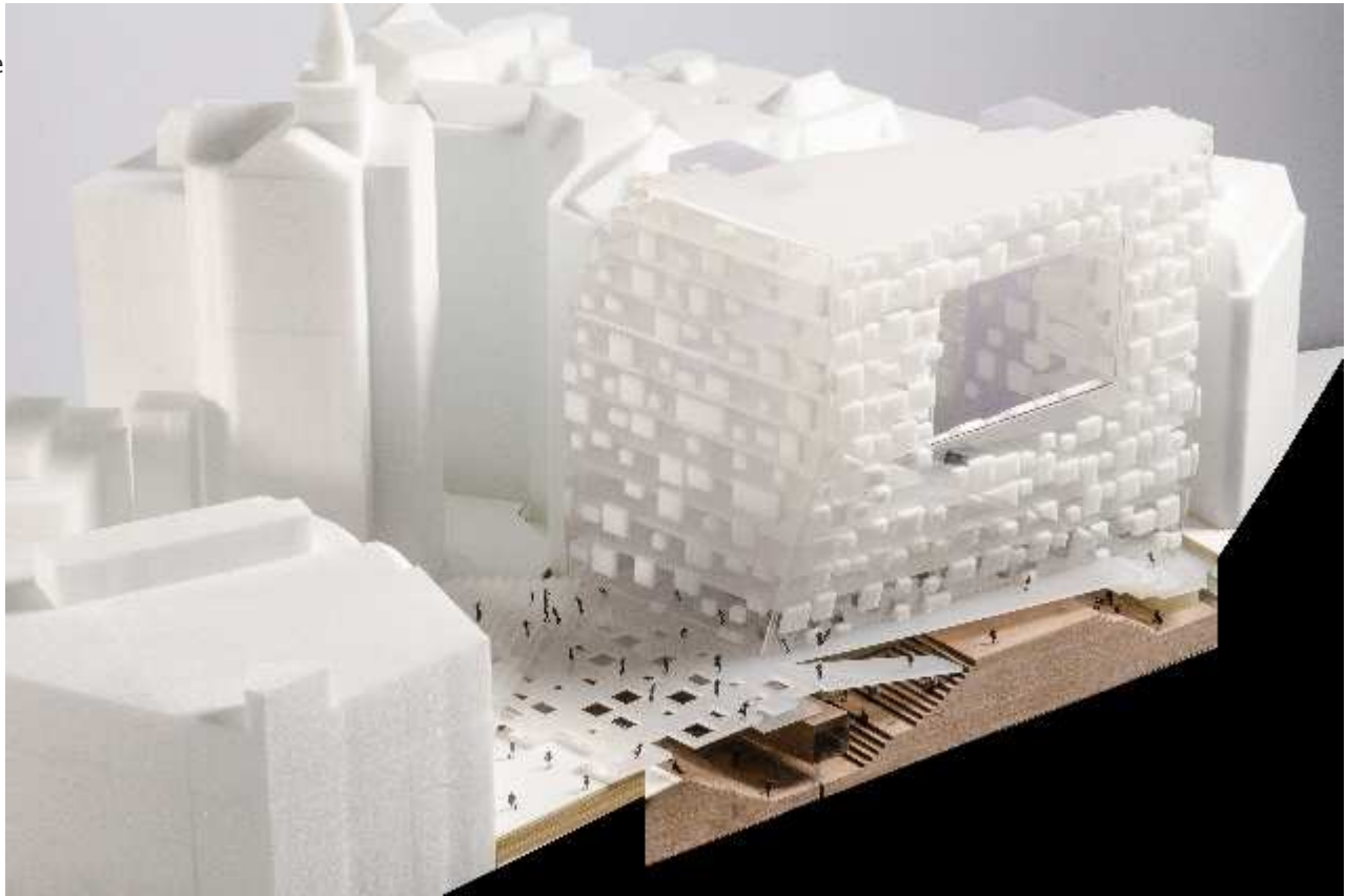
Global Centre for Social Sciences proposal – Team B