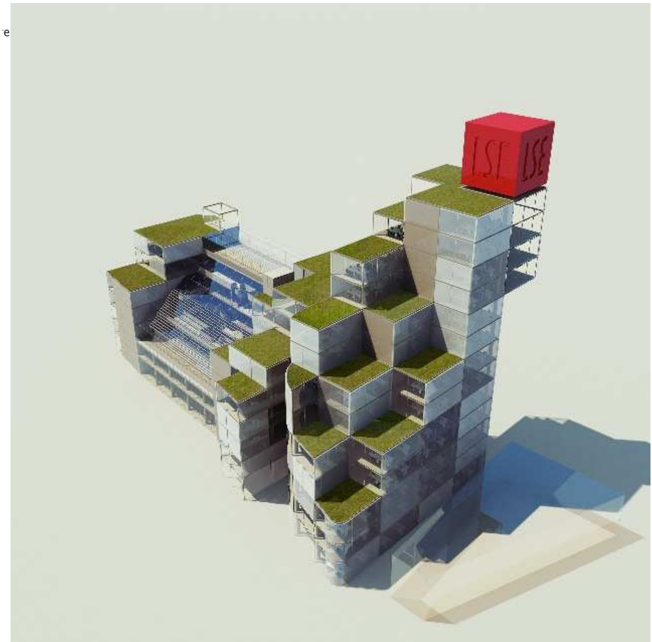
Global Centre for Social Sciences proposal – Team A