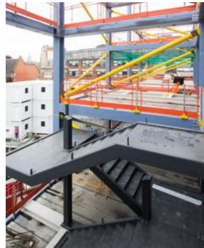
3. Staircase installation