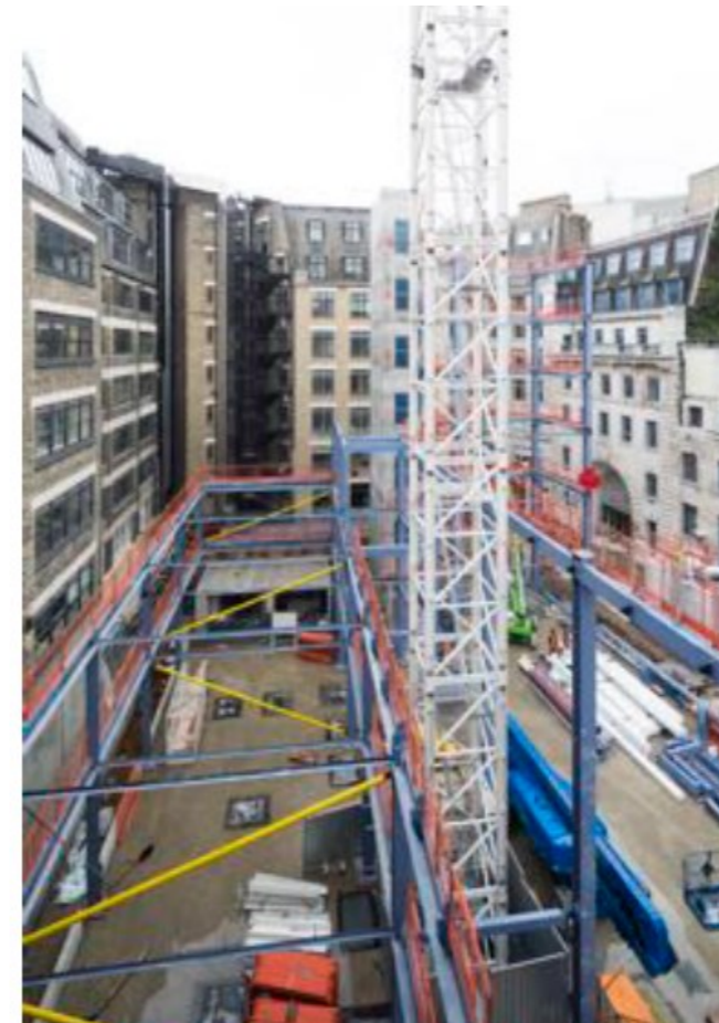
1. Super-structure works progress