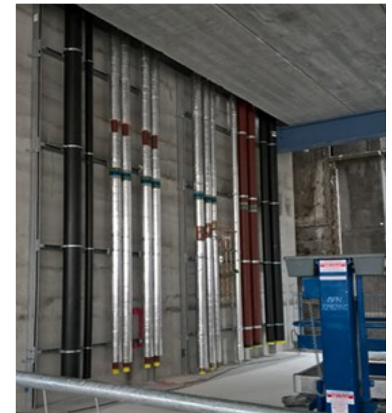
4. East core mechanical riser module installed