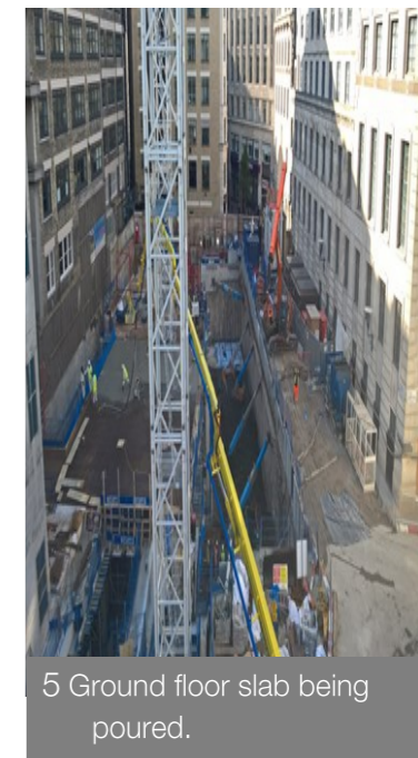
5. Ground floor slab being poured.