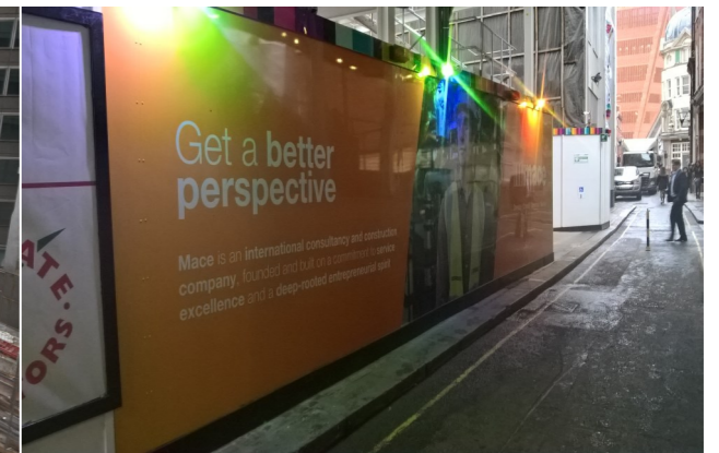
3. Newly installed Mace hoarding