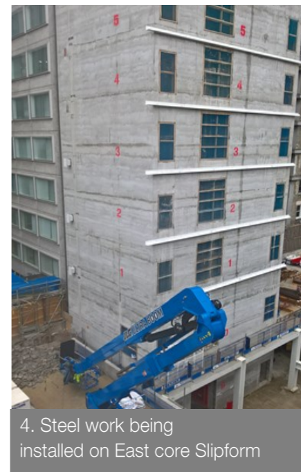
4. Steel work being installed on East core Slipform