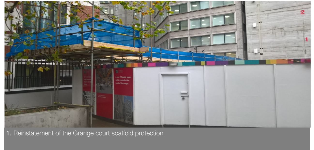
1. Reinstatement of the Grange court scaffolding protection