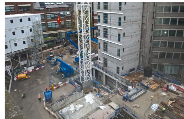
2. Reorganisation of site logistics area