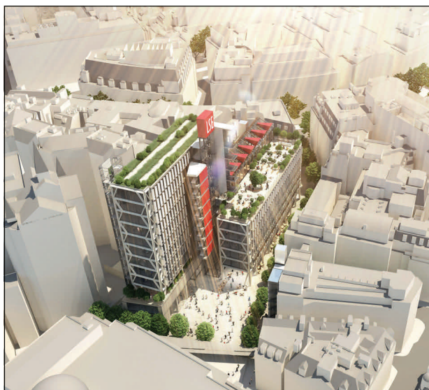
Aerial view of the new building looking towards the Aldwych from the Library