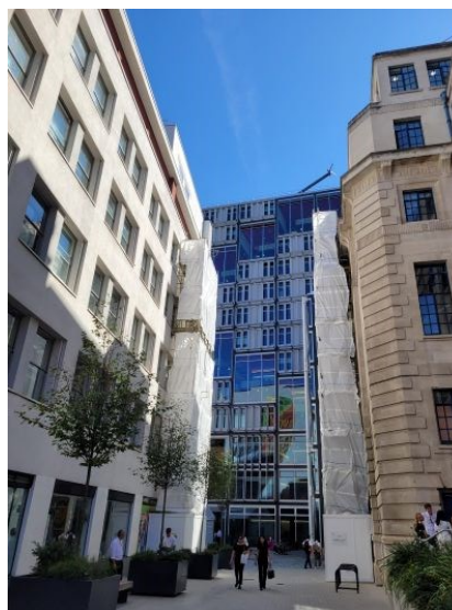
View from Clare Market with link bridge removed