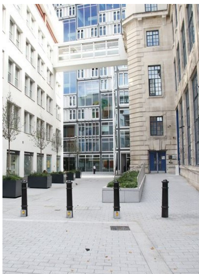
View from Clare Market showing link bridge

The refurbishment of selected areas of Level 1 and 2 will take place from January until September 2024.