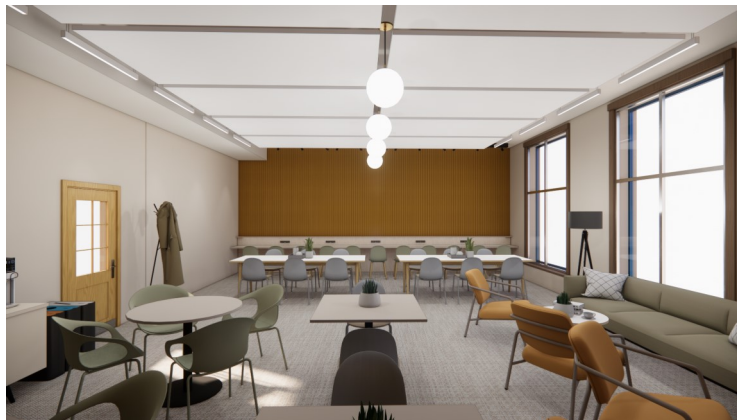
Anthropology Common Room L6 (visual)

Level 3 and 3M are under refurbishment. Part of level 3 will be complete by 8 January 2024. The remainder of level 3 and 3M will be completed in June 2024. Level 2M demolition will start on 30 November 2023 and the refurbishment works will begin in January 2024.