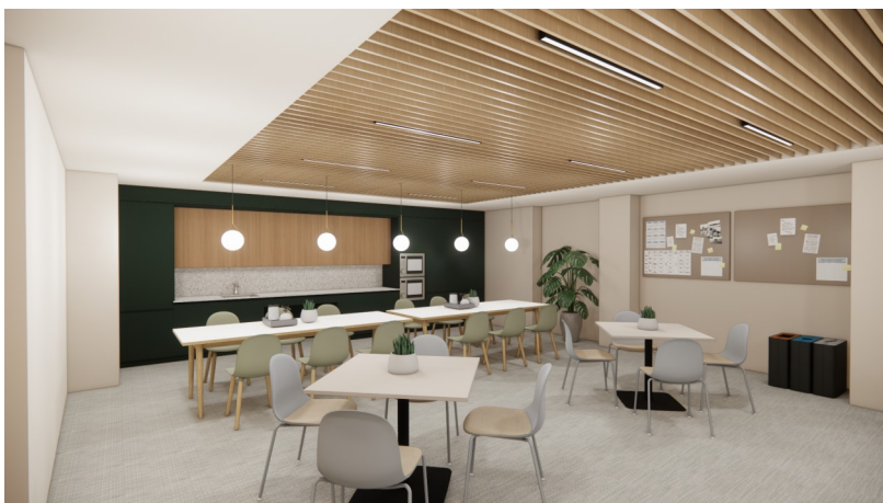
Sociology Common Room L3 (visual)