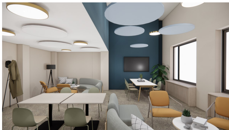
Social Policy Common Room L2 (visual) - planned completion Sept 24.