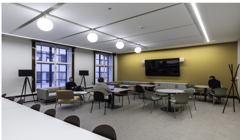
Anthropology common room L3 completed in Jan 23.

The removal of the hoist will take place in July 2024.