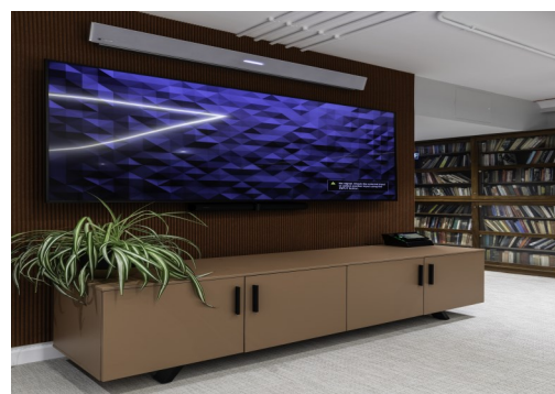
Anthropology Library L6 completed in Dec 23