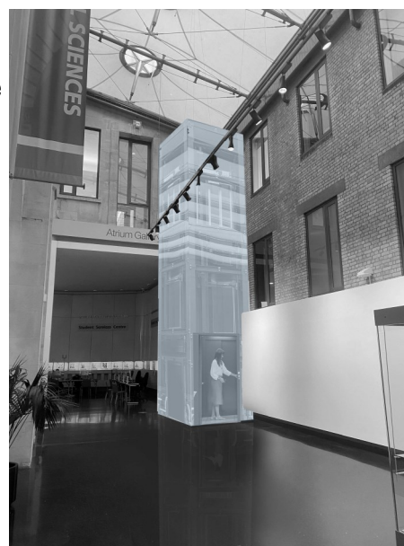
Atrium Lift in Student Services Centre