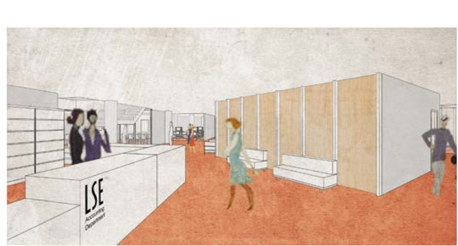
View of the reception area