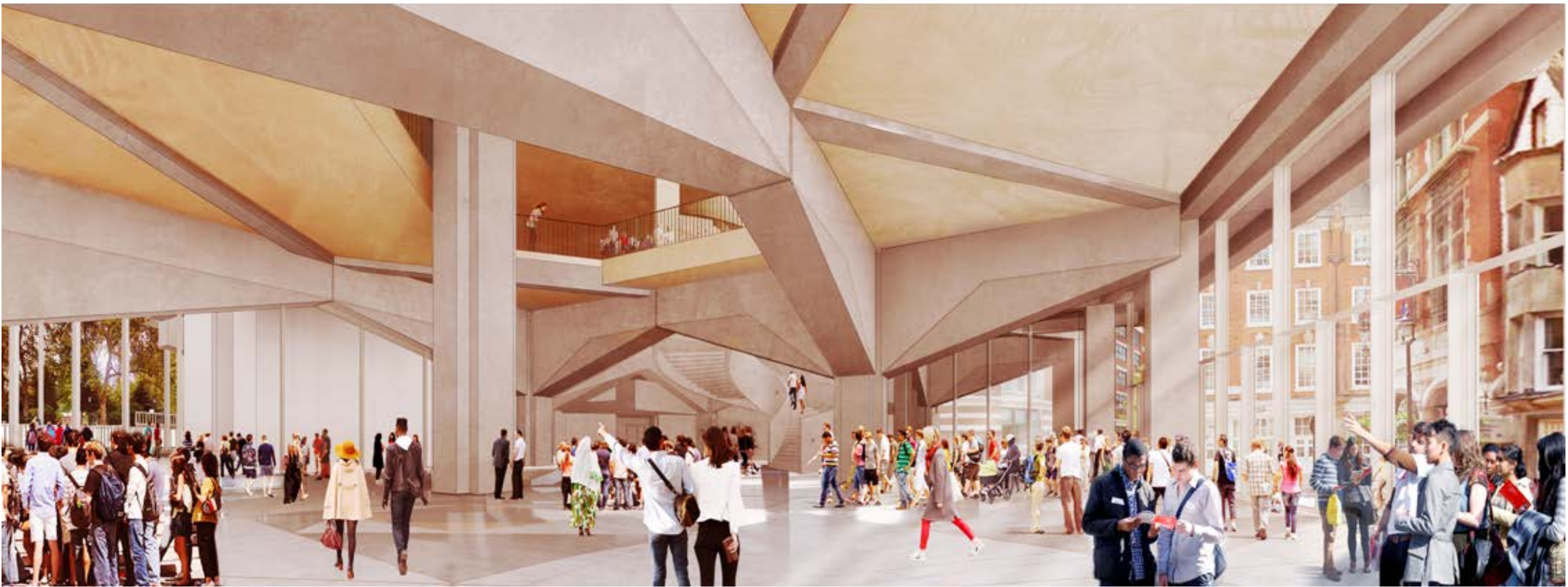
View of the Great Hall

The Grand Hall is a generous, largely unprogrammed, flexible civic space. This type of space does not currently exist elsewhere at LSE and will be suitable for a range of informal and formal uses including student fairs, performances and receptions.