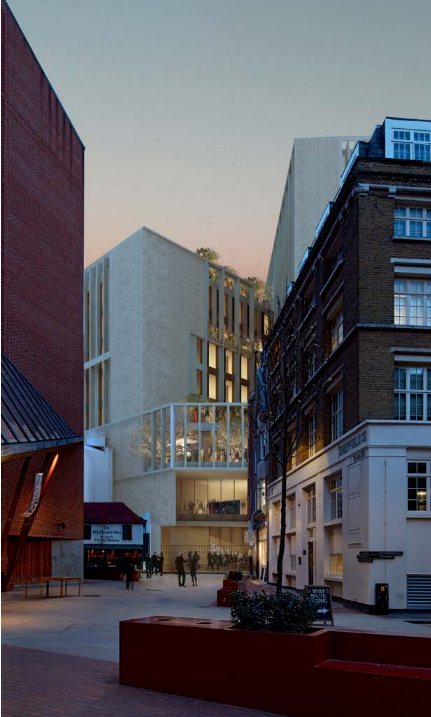
View from Sheffield Street

Entrance doorways, screened terraces and gardens, solid gables, rhythm of windows and screens all come together to form a unified dynamic form.