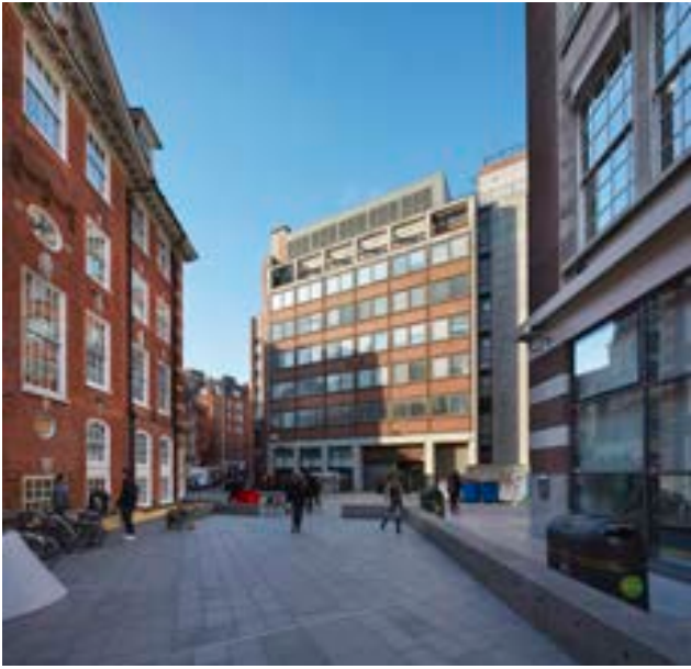
Existing view approaching 44 LIF from John Watkins Plaza

A double height entrance addresses the important axis of Sheffield Street making a clear connection with the Saw Swee Hock Student Centre.