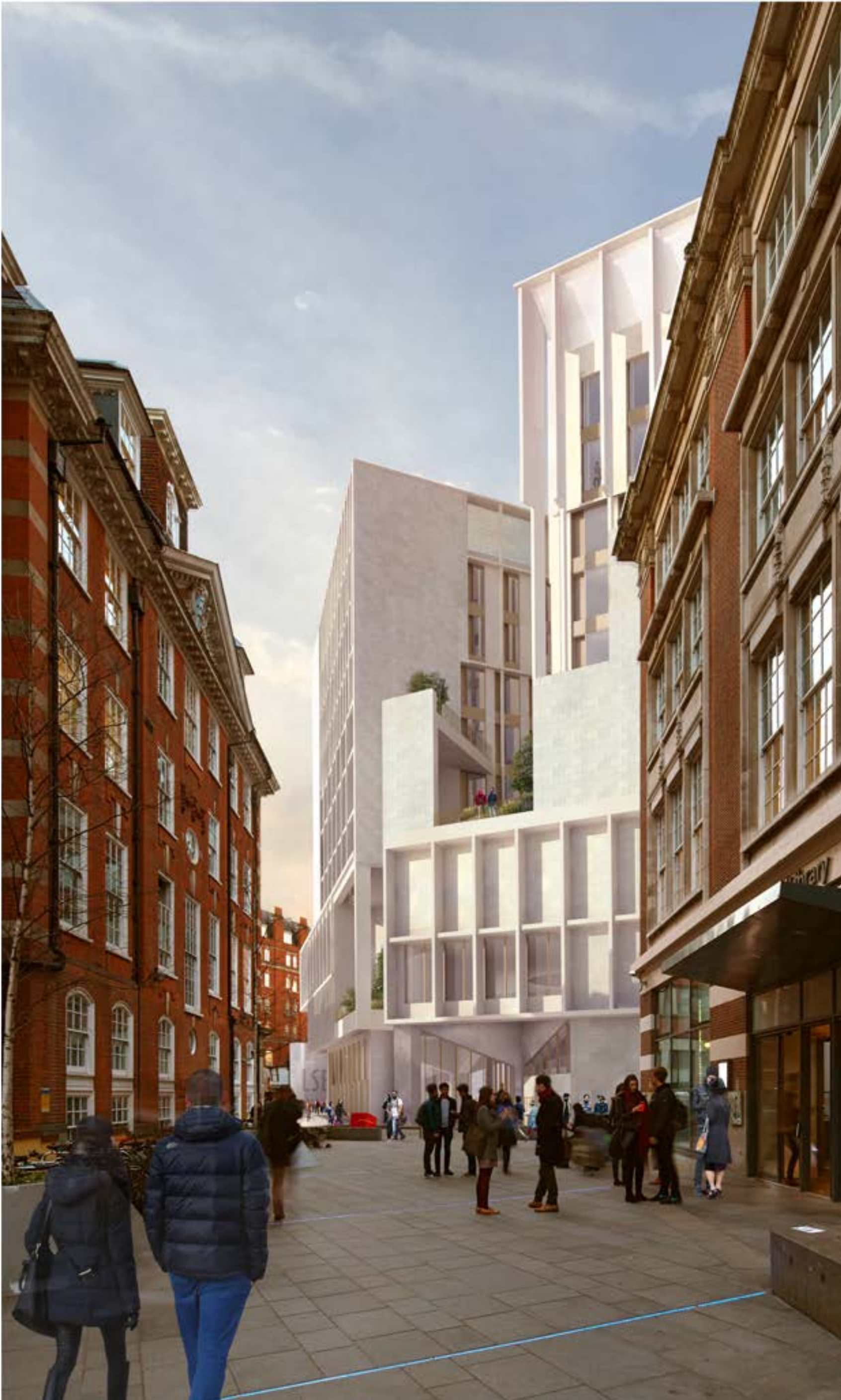
View from John Watkins Plaza