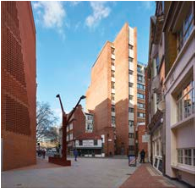
Existing view approaching 44 LIF from Sheffield Street

A double height entrance addresses the important axis of Sheffield Street making a clear connection with the Saw Swee Hock Student Centre.