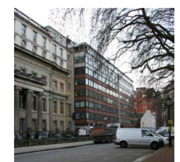
View of existing 44 LIF from Lincoln's Inn Fields