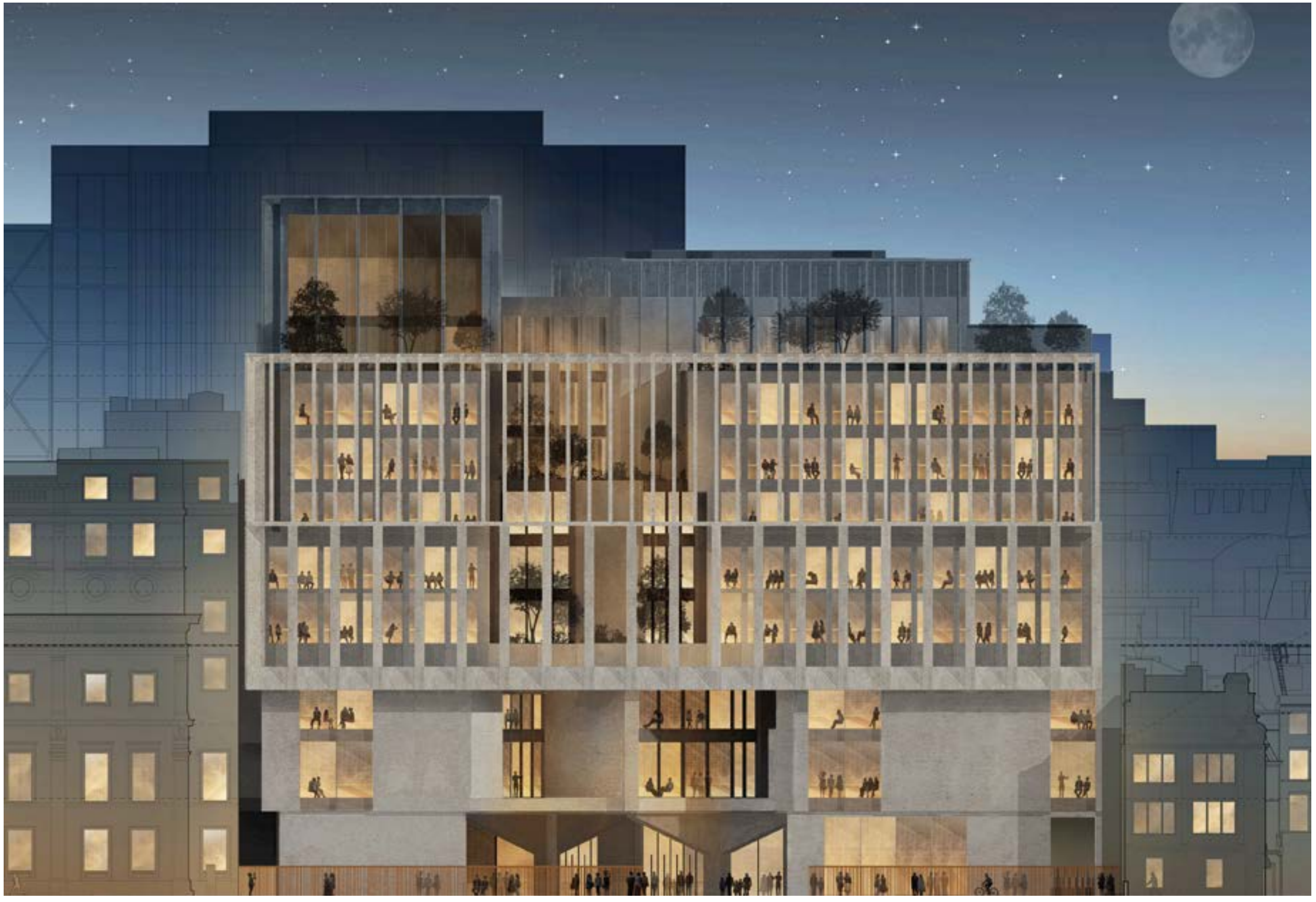
View of the North elevation facing Lincoln's Inn Fields at dusk - scale 1:250