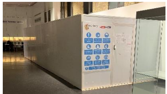
Example image of hoarding system from the Old Building project