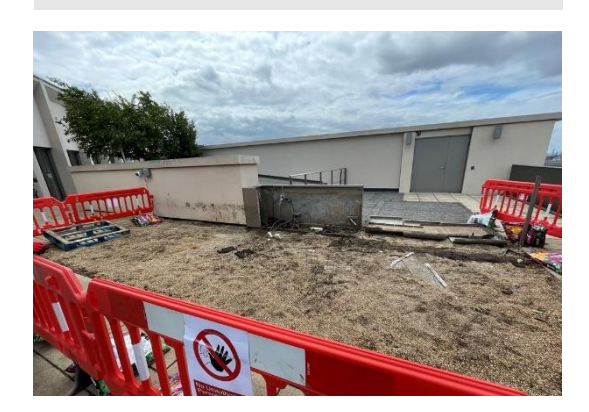
Outdoor terrace planter on L9 is removed