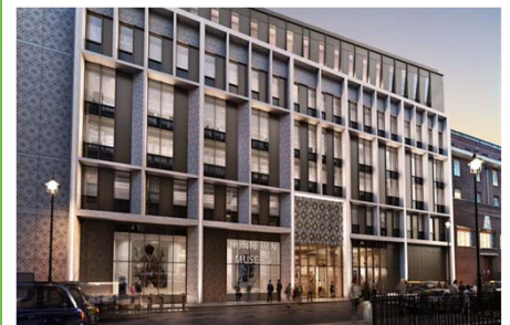
Fig 01 - CGI Image of Portugal Street Façade

We hope that you find these communications of interest and we look forward to meeting and engaging with our local community as the project proceeds. If you would like to get in touch about our project please send us an email to RCS@wates.co.uk .