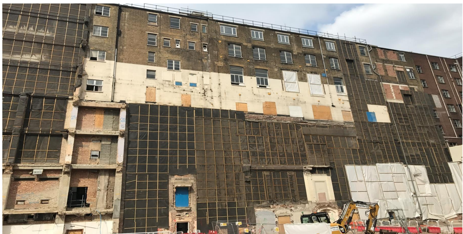
Continued Weatherproofing to retained Barry Building exposed elevation