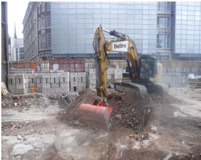
Continued works to excavate basement slab level