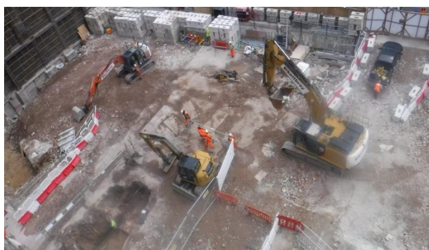
Overview of Courtyard Works