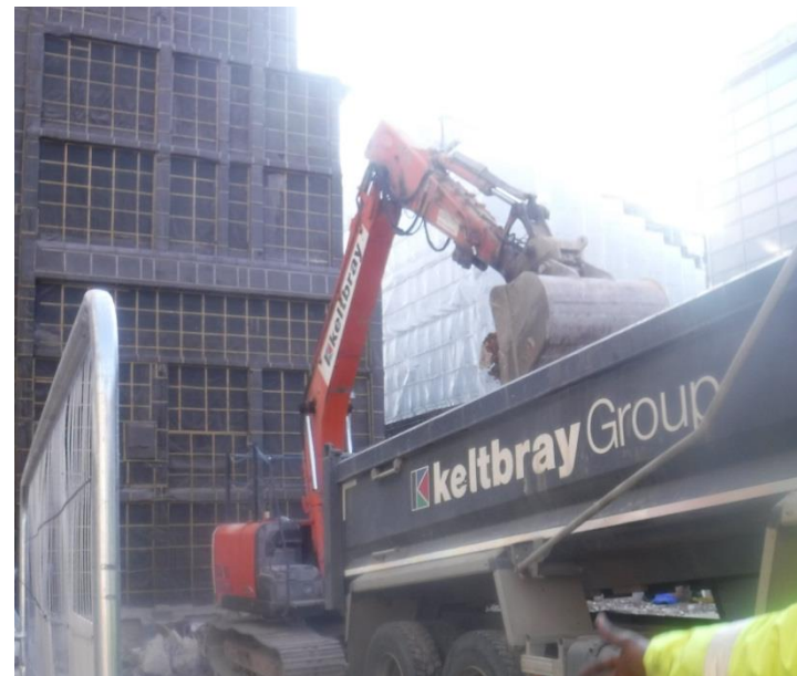
Regular removal of excavation arising's via Portugal St.