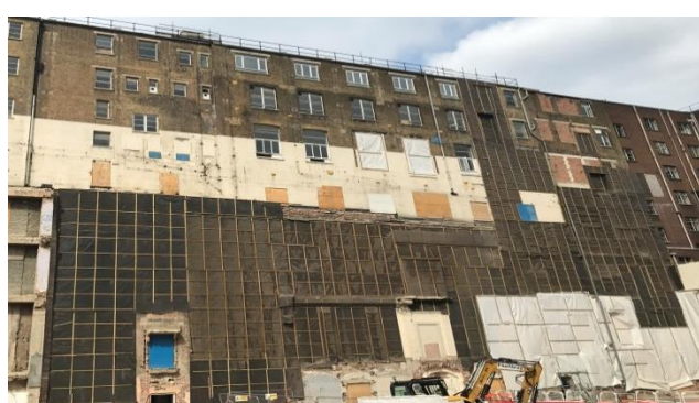
Continued Weatherproofing to retained Barry Building