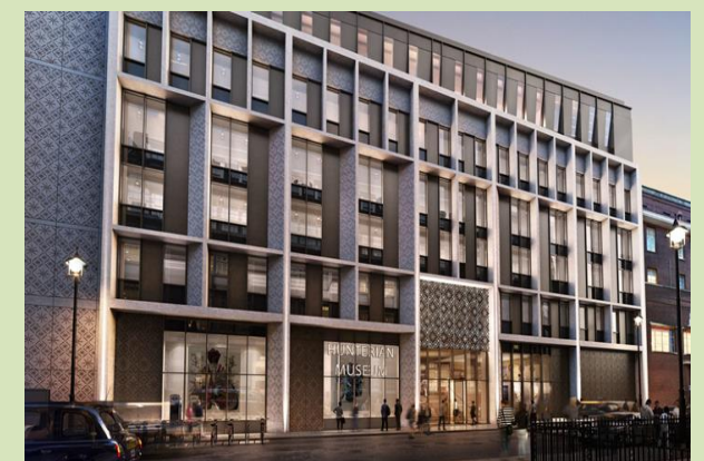
The planned new Portugal Street façade

The current building arrangements and layout at the Royal College of Surgeons are no longer capable of meeting its needs, so the plan is to consolidate its activities within a refurbished and partially re-developed Barry Building. This will enable the building to meet member aspirations for the 21st Century.