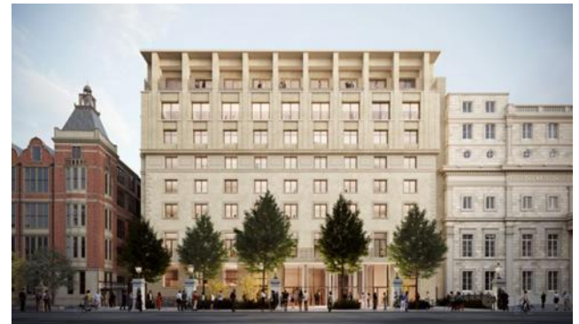
Image of the proposed Firoz Lalji Global Hub on Lincoln's Inn Fields

The graduations this week and the wonderful Christmas lights (thanks to the Maintenance team and our electrical sub-contractor, R+I) remind us just how special LSE is both as an institution and a physical place within London, which is now widely recognised. It is the positive feedback from staff, students, alumni and visitors that make our jobs worthwhile.