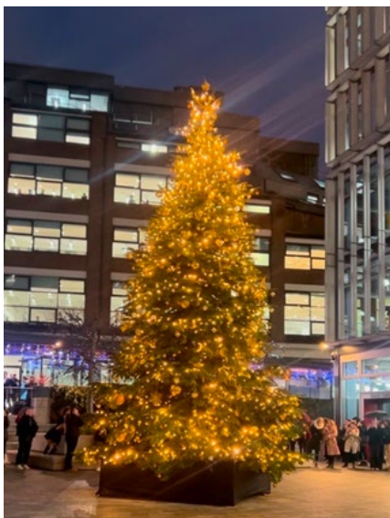
CBG Square, Christmas 2024

After another eventful year, it is time to take a break and where we can, be with family or friends reflecting on the year past and looking forward to the year ahead. However, the estate never sleeps, and we are ever grateful to the Estates staff who will be in over the holidays ensuring our campus and residences are secure, maintained, and clean.